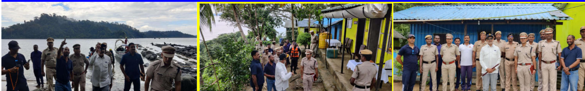
Hon'ble Lt Governor visited LOP Luis-in-Let Bay and interacted with officials of Police & AAJVS on 09.11.2022.