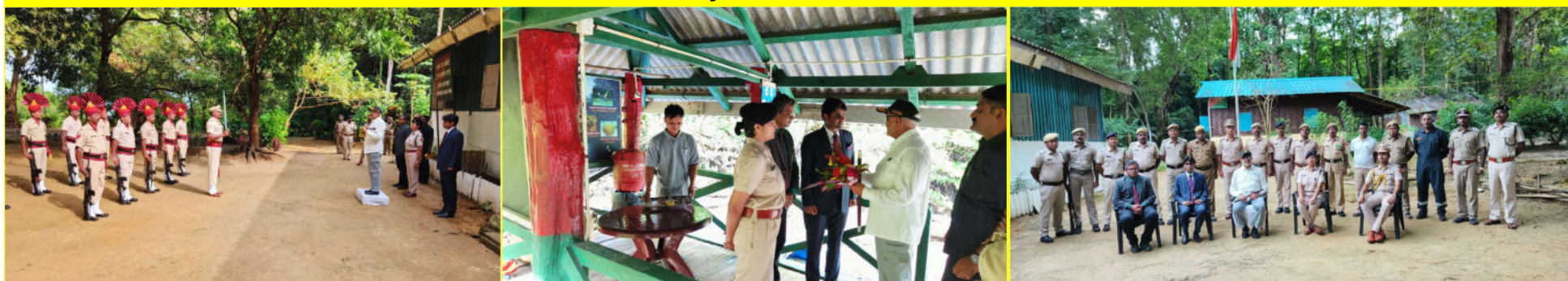
Hon'ble Lt Governor interacting with officials of Police and Forest at Interview Island on 09.11.2022.